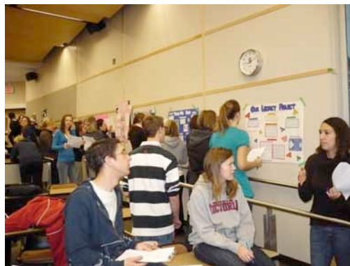
Students @ UVic Participating in the Teach In

A major milestone for the education pillar this year was the successful introduction of SEAP (Sustainability Education Across the Province), a collaborative effort between goBEYOND, Walking the Talk and SFU. SEAP