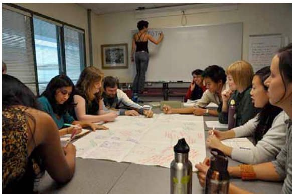
The personal green plan workshop is piloted at UBC-Vancouver

long time goBEYOND volunteers. The creative ideas and capacity for change emerging from this workshop have gained lots of attention from senior administration, who want to implement Imagine a Sustainable UFV on a bigger scale. A retreat will be taking place over the course of the summer to turn some of the ideas from the workshop into tangible projects.